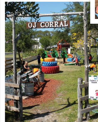
The O.J. Corral Al's "Agri" playground and Observation-grove is great fun for all ages.