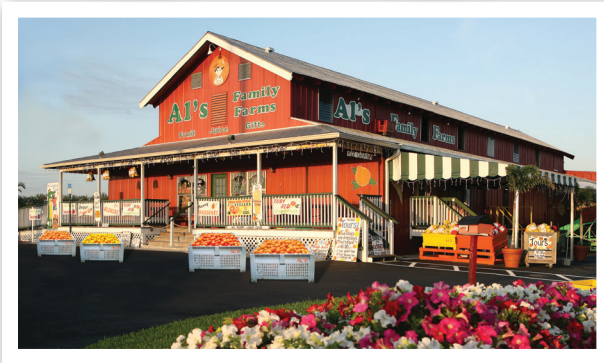
Al's Family Farms historic big red barn.